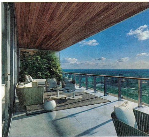
From top: The terraces at 57 Ocean were designed to resemble rippling water; half of the residences in the building will boast unobstructed views of the Atlantic Ocean.